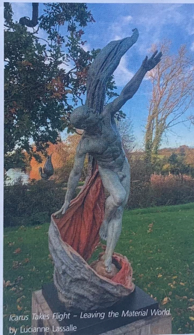
Icarus Takes Flight - Leaving the Material World by Lucianne Lassalle